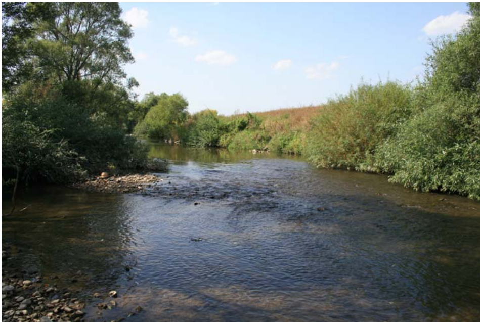
A Rima/Rimava Rimaszécs/Rimavská Seč mellett